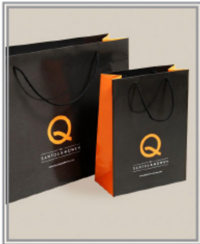
Luxury Bags Brown & White