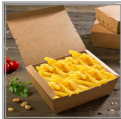
Meal Fries Box