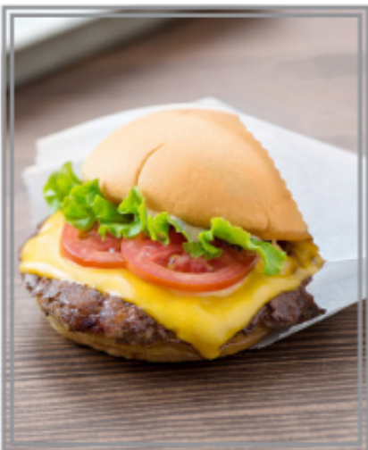
Burger Bags Brown & White