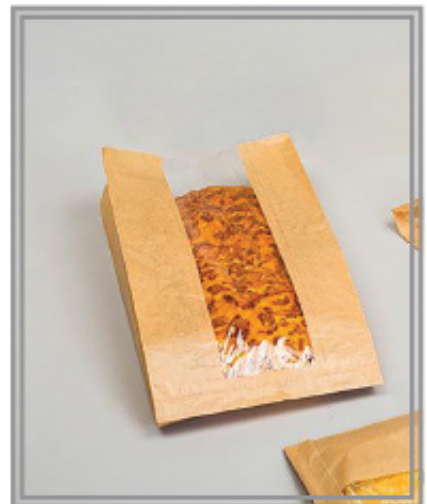
Satchel Bags with Plastic window Brown & White