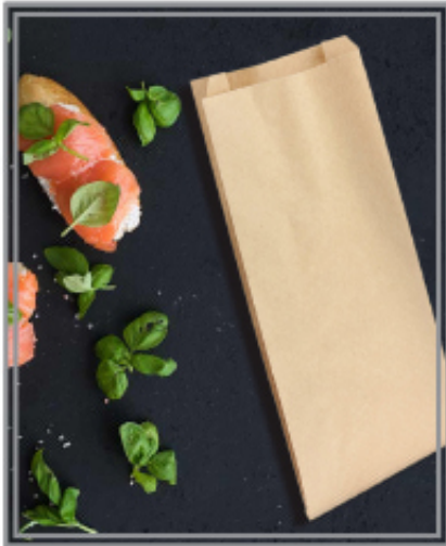
Satchel Bag Brown & White