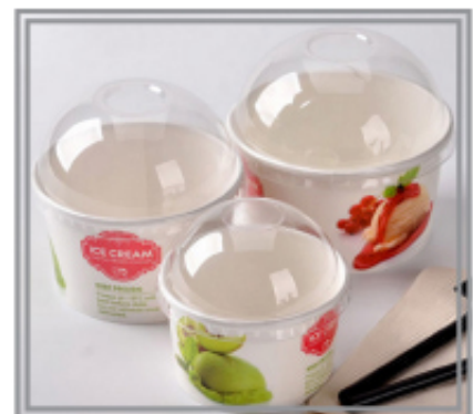
PET DOME LID

Sizes: 4 Oz, 6 Oz, 8Oz, 12 Oz, 16 Oz, 36 Oz