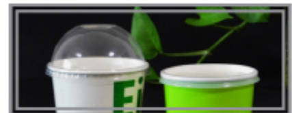
DOME / FLAT LID

Sizes: 16 Oz, 20 Oz, 30 Oz, 36 Oz, 40 Oz