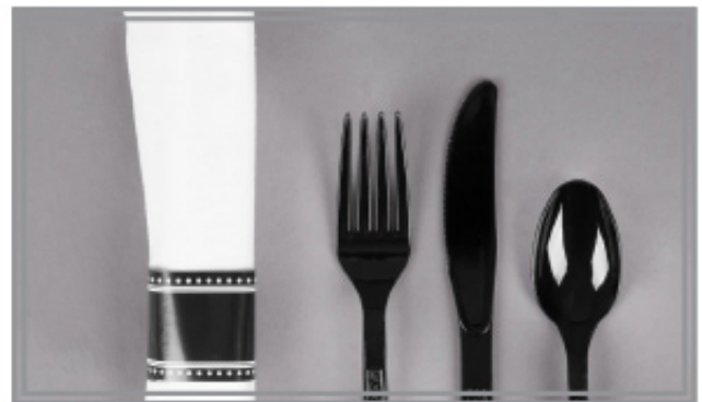
FORK / KNIFE / SPOON