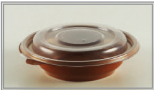
MEZZA BOWL WITH PP LID

Size: 250 cc, 375 cc, 500 cc Brown color (Transparent)