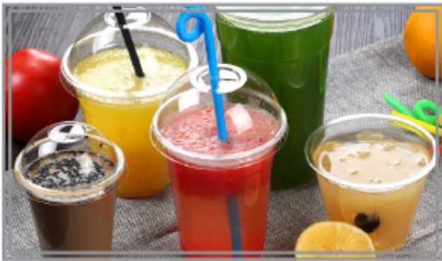
JUICE CUPS WITH LIDS DOME/FLAT