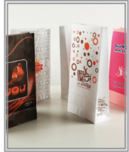
SOS Bags Brown & White