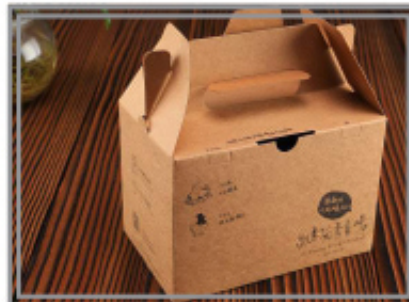
Kids Meal Box