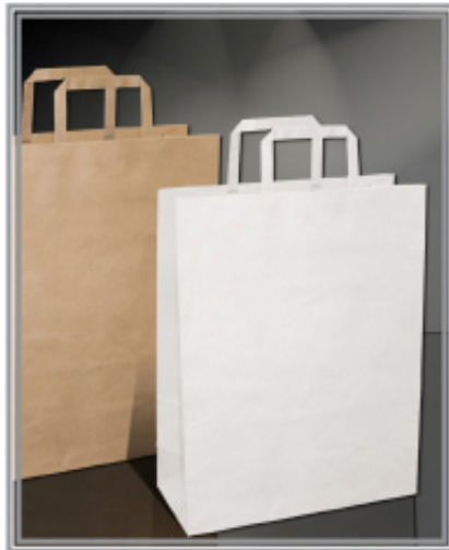
Flat Handle Bags Brown & White