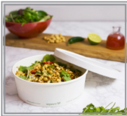
FOOD BOWL WITH LID WHITE