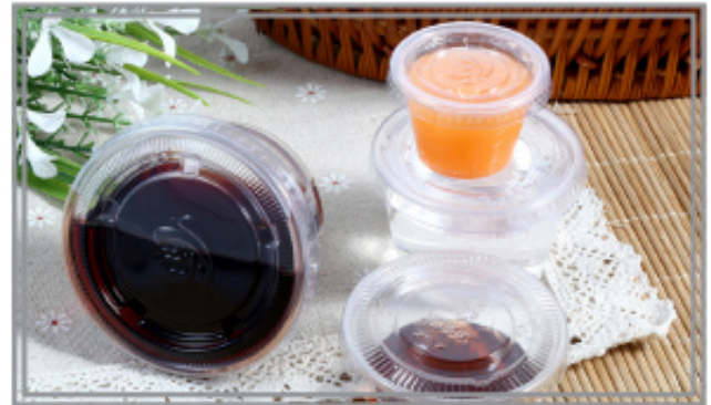
SAUCE CUP WITH PS LID