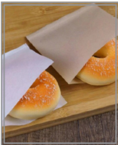
Bread Bags Brown & White