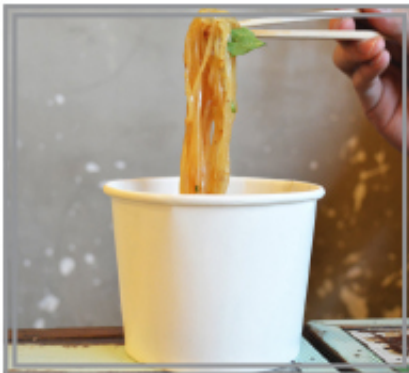
FOOD BOWL WITH LID WHITE