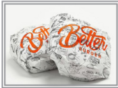
PE Coated & Sulphate