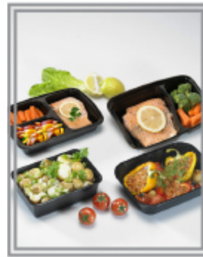
Microwave Containers With PP Lids

1, 2 & 3 Compartment Sizes: 24 Oz, 36 Oz