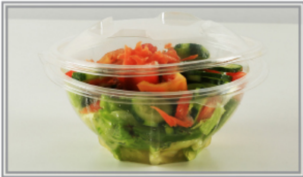
SALAD BOWLS WITH LIDS

Sizes: 250 cc, 375 cc, 500 cc, 750 cc, 1000 cc Hinged Lid & Separated Lid (Transparent/Black)