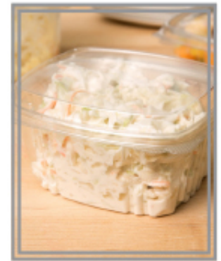
Transparent Rectangular Container

1, 2 & 3 Compartment Sizes: 24 Oz, 36 Oz