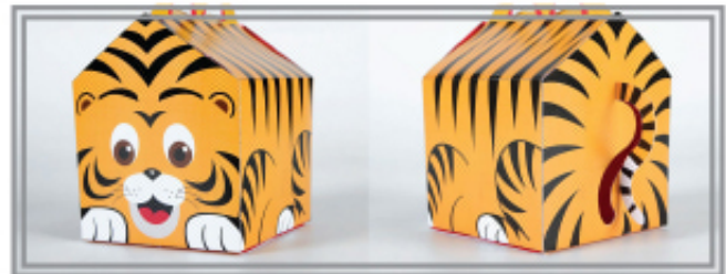
Kids Meal Box