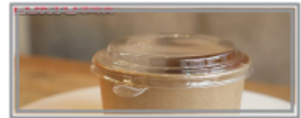
PET DOME / FLAT LID