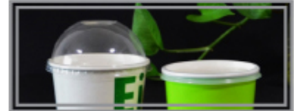
PP DOME / FLAT LID

Sizes: 4 Oz, 6 Oz, 8Oz, 12 Oz, 16 Oz, 20 Oz, 30 Oz, 36 Oz, 40 Oz, 130 cc, 175 cc