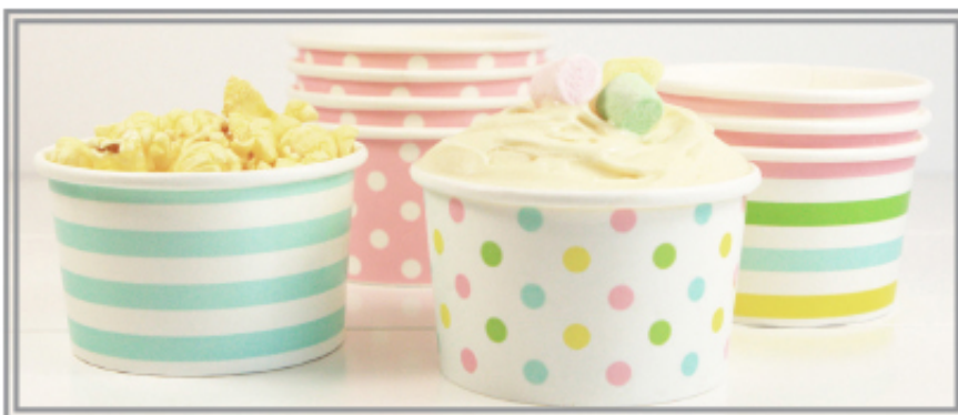
ICE CREAM CUPS

Sizes: 4 Oz, 6 Oz, 8Oz, 12 Oz, 16 Oz, 36 Oz