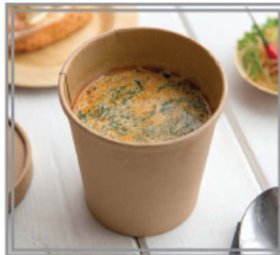
FOOD BOWL WITH LID BROWN