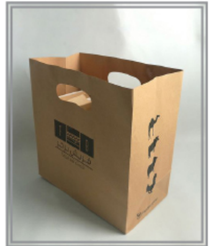
Grab Hole Bags Brown & White