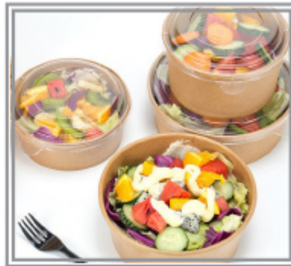
FOOD BOWL WITH LID BROWN