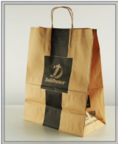
Twisted Handle Bags Brown & White